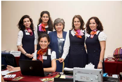
Conference Management & Events team

Thanks also to the Ramada Hotel for the great venue and excellent catering