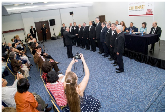
Academic Male Choir “Gusla