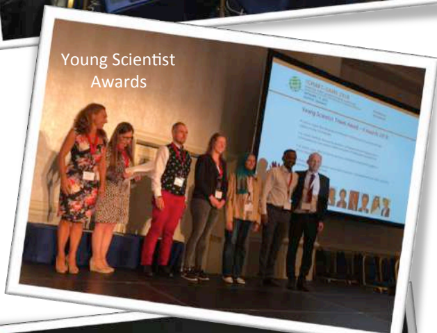
Young Scientist Awards