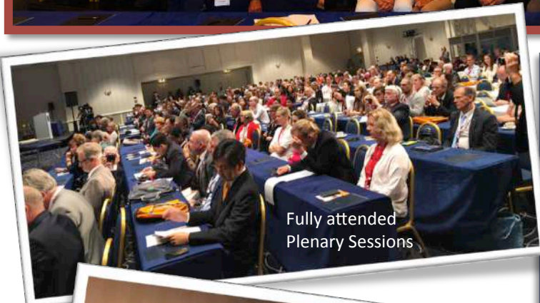
Fully attended Plenary Sessions