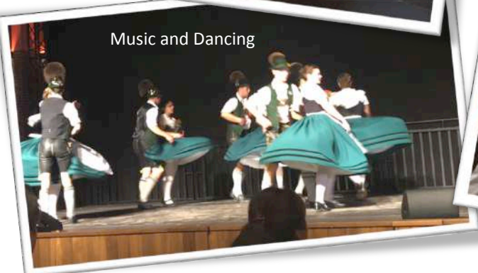
Music and Dancing